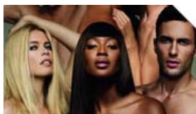
BEHIND THE SCENES FOOTAGE OF NEW TESTINO AD