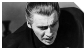
HAMMER TIME! LONDON'S MOST FRIGHTENING FESTIVAL