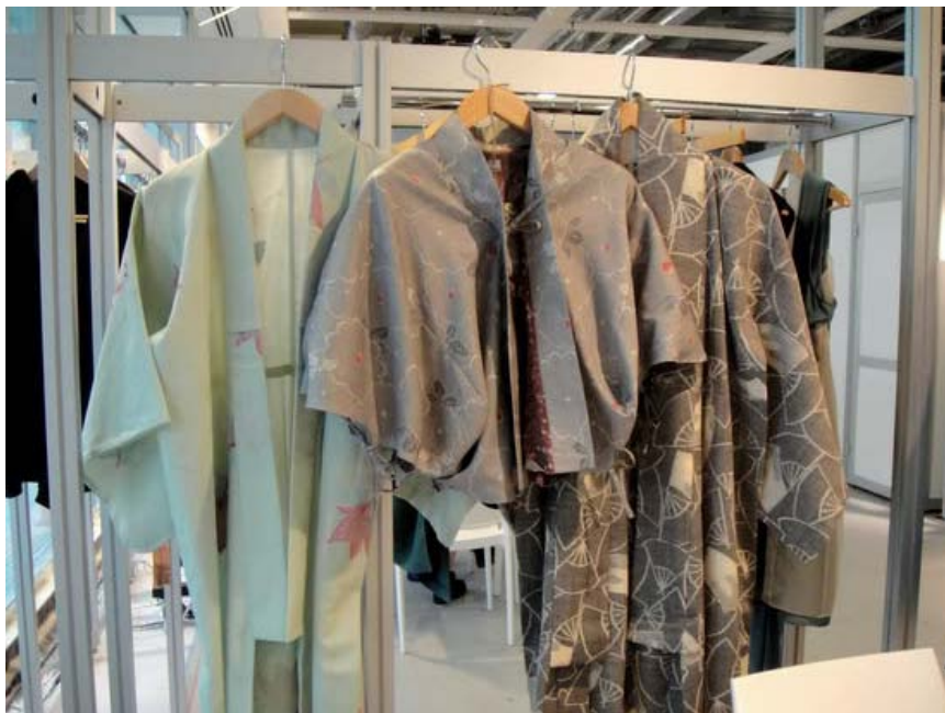
The grey piece in the middle is the Rei Coat and is selling for £245 Too much for me unfortunately