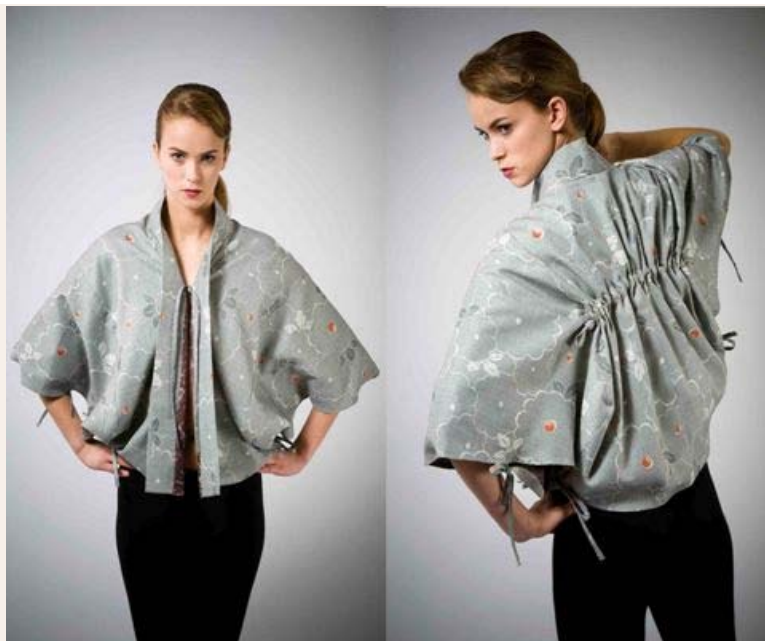
Rei Coat, taken from Smallprint collection AW09/10).

Once back in London, the garments are produced by a registered women's project. Beautiful Soul's debut A/W 09 collection 'Smallprint' included Fair Trade cotton and satin and jersey made from sustainable bamboo alongside up-cycled kimono fabric from the 1940s. Swathes of fabric in muted, patterned materials are gathered into rouching, and structured collars add definition to compelling silhouettes. The collection precipitated a run of awards, including Ethical Fashion Forum's Innovation Award in February 2009 and more recently the brand won a Future 100s Budding Entrepreneur on the Horizon 2009 recognition.