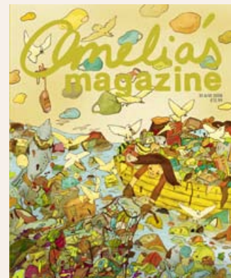
Amelia's Magazine Issue 10