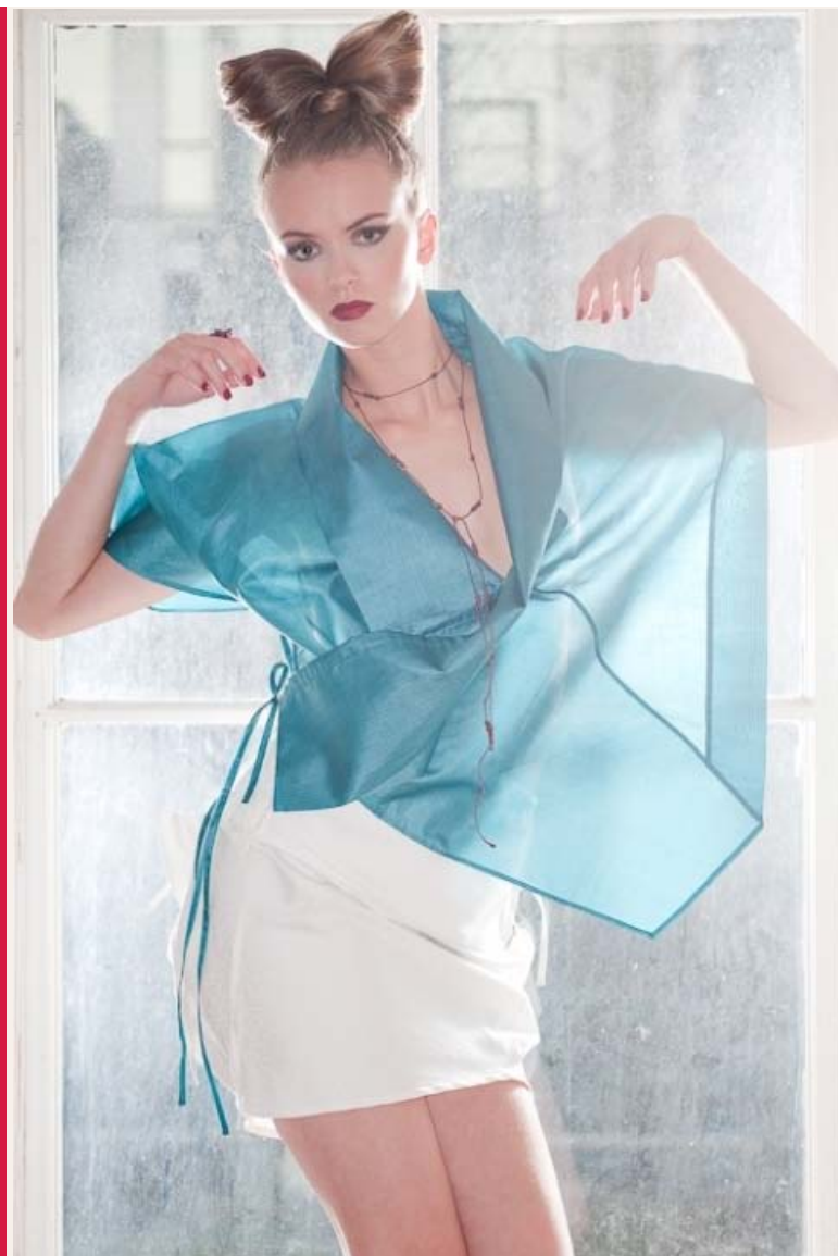
Izuko blouse and Kimie skirt taken from the Miss Butterfly collection (SS10).