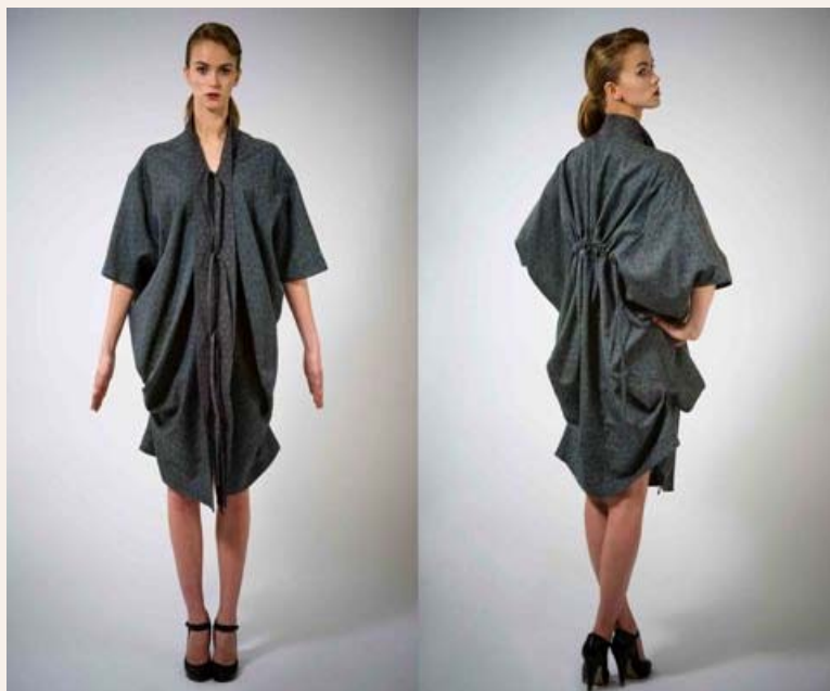
Yoshie Coat, taken from Smallprint collection AW09/10).

Once back in London, the garments are produced by a registered women's project. Beautiful Soul's debut A/W 09 collection 'Smallprint' included Fair Trade cotton and satin and jersey made from sustainable bamboo alongside up-cycled kimono fabric from the 1940s. Swathes of fabric in muted, patterned materials are gathered into rouching, and structured collars add definition to compelling silhouettes. The collection precipitated a run of awards, including Ethical Fashion Forum's Innovation Award in February 2009 and more recently the brand won a Future 100s Budding Entrepreneur on the Horizon 2009 recognition.